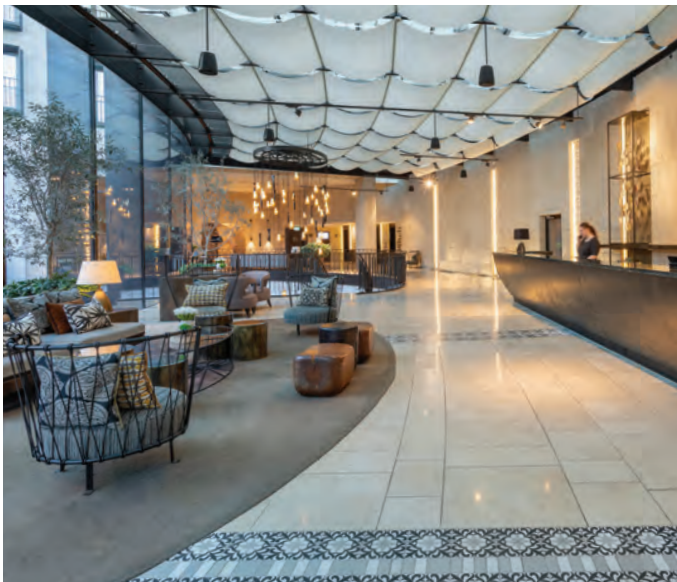
Orient Hotel, Jerusalem