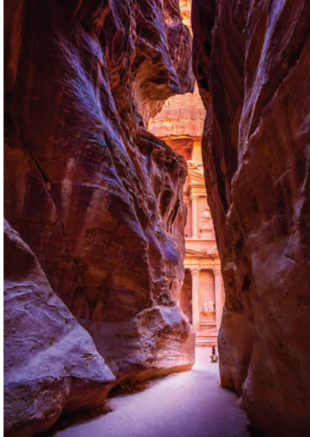
The Siq, Petra, Jordan

A most unforgettable day in Petra! Your local guide will take you on a tour into the "rose-red" city (by horseback and foot), from the main gate to the beginning of the "Siq". At the end of the passage you'll see Petra's most beautiful monument—the Treasury—carved out of the solid rock from the side of the mountain. Beyond the Treasury, you'll discover soaring temples, elaborate royal tombs, a theatre, burial chambers and water channels. After lunch, continue to Amman, the modern and ancient capital of Jordan; check into your deluxe hotel for overnight. (B.L)