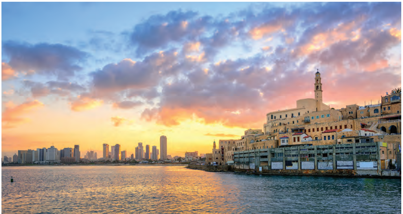
Port of Old Jaffa and Tel Aviv City

MIX & MATCH THE ABOVE HOTELS. CALL FOR DETAILS. FOR TOURING BY PRIVATE CAR, SEE PAGE 30.