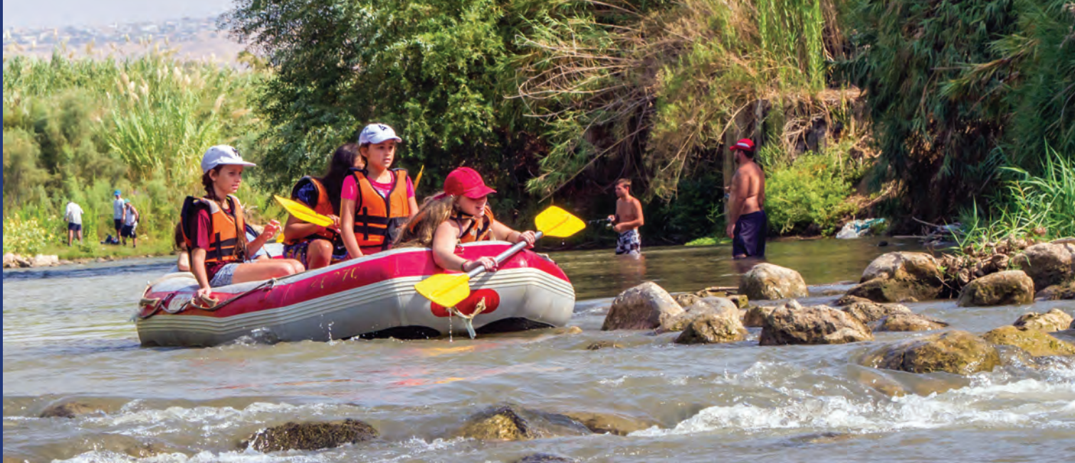
Rafting on the Jordan River