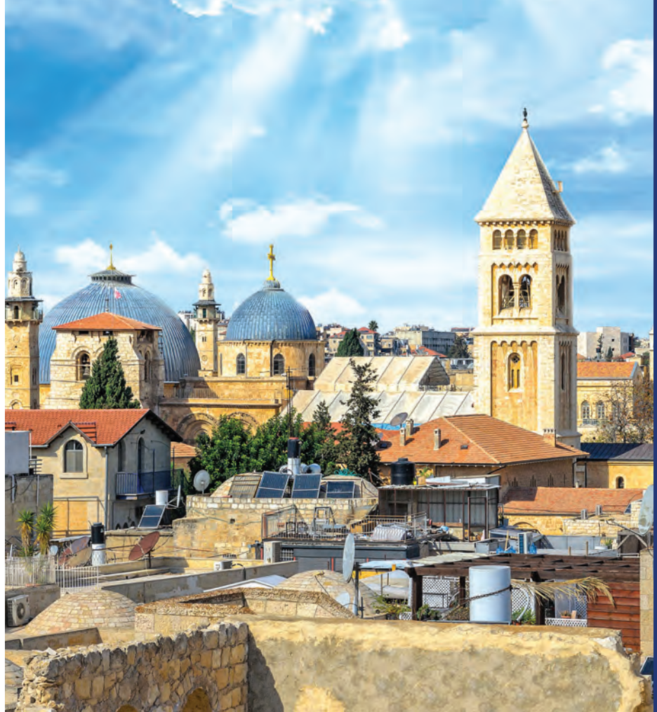
Christian Quarter, Jerusalem

Transfer to the Airport for your departure flight; special assistance is provided for check-in service.