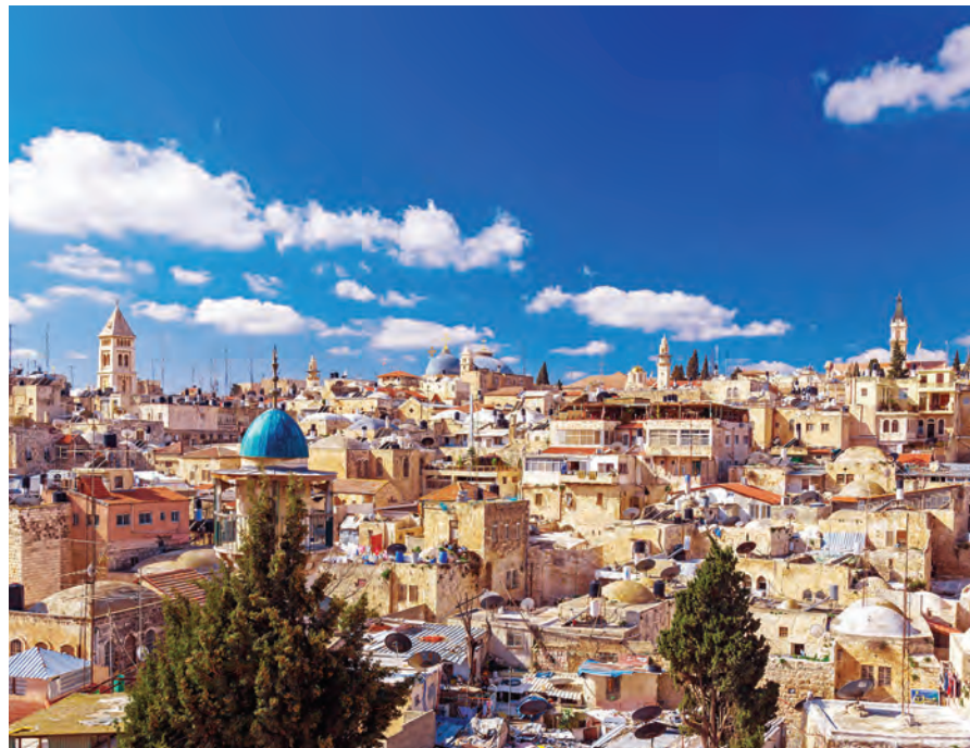
Christian Quarter, Jerusalem

This unique tour offers you the opportunity to discover the Holy Land in luxury and style in your own Private Car with your own Private Guide. Journey through the Galilee from Nazareth to the lake of the fishermen, just as Jesus and His disciples did 2000 years ago. Pause, contemplate and pray in Jerusalem, in Bethlehem, in Nazareth and at the Sea of Galilee. The touring inclusions listed in the itinerary are just a sample of what you will experience. Your Tour Director will custom-tailor your route to match your personal needs and interest; you'll travel to the sites and churches favored by your Christian denomination. This special program is ideal for couples, groups of friends and families. You've always dreamed of visiting the Holy Land. Now is the time!