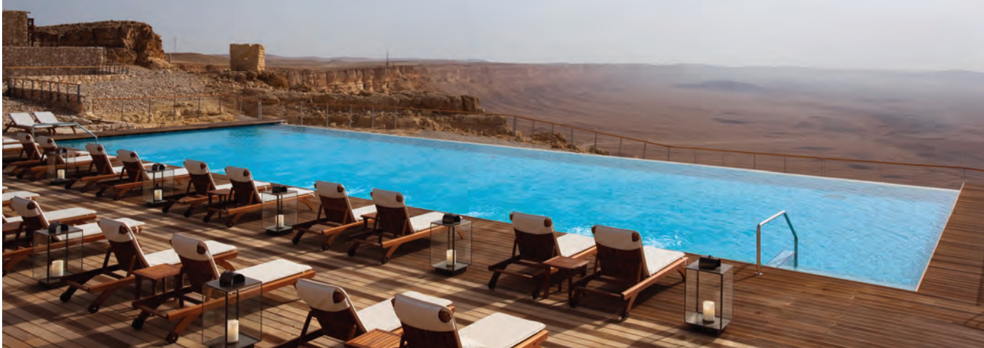
Beresheet Hotel Swimming Pool, Mitzpe Ramon