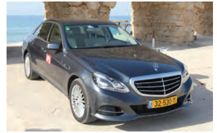
Luxurious Mercedes Benz E Class

Your own private "private car or microbus," with your own private "private guide/driver" is available for your exclusive use following the same touring sequence as the Prelude, Minuet, Overture, Rhapsody, Serenade, Fantasia and Symphony Tours. Private Car arrival and departure transfers are also included between airports and hotels (all must arrive and depart together). Note that Israel Plue Eilat & Petra also available by private car, please inquire.