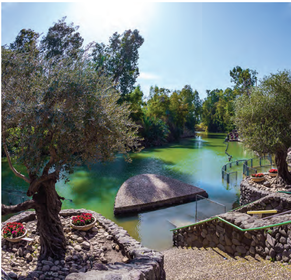
Yardenit Baptismal site at the Jordan River

Travel to the top of the Mount of Olives and marvel at the magnificent view of the Old City. Descend to the Garden of Gethsemane with its ancient olive trees to see the Church of All Nations. Drive via the Knesset (Parliament) to the Shrine of the Book, home of the Dead Sea Scrolls. Continue along the rolling Judean Hills to charming Ein Karem, birthplace of John the Baptist; see the Church of the Visitation. Then proceed to Yad Vashem, Memorial to the Holocaust; visit the Museum, Children's Pavilion and walk along the Avenue of the Righteous. End the day with a visit to Bethlehem and Manger Square (conditions permitted; tour operated by the Palestinian Authority—Passports required). (B)