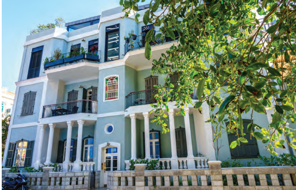
Unique Bauhaus Architecture, Tel-Aviv

Begin the day with a view of the golden-domed Baha'i Shrine and visit the breathtaking "hanging gardens," – a UNESCO World Heritage site. Drive along the coast to Rosh Hanikra; descend by cable car to see the magnificent underwater grottoes. Time to enjoy some fine wines at a local winery. Then continue to the timeless Crusader city of Acre; walk through the subterranean city and bazaars that recall the colorful Middle Ages. Free evening to enjoy a stroll under the Carmel skies and the glow of this beautiful port city. (B)