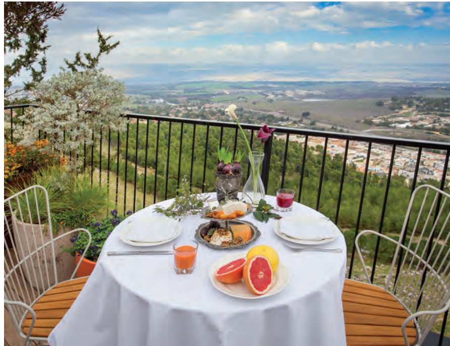
Galilee View from Mitzpe Hayamim

(B) Breakfast (L) Lunch or (LM) Light Meal (D) Dinner