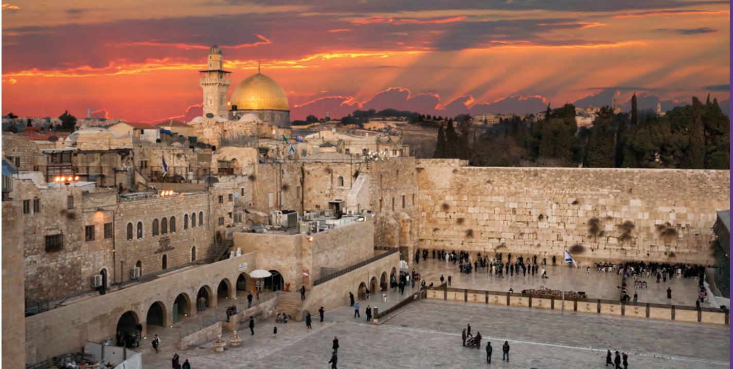
Western Wall, Old City Jerusalem