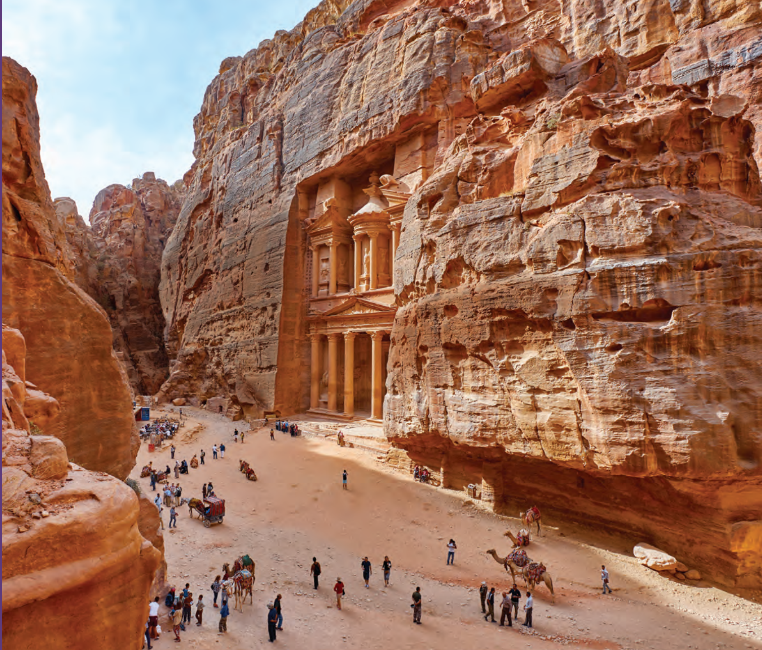
The Treasury-Petra, Jordan

Artists' Quarter. On to Capernaum, by the Sea of Galilee, to see the fantastic ruins of the ancient synagogue dating back to the 5th-century. Ascend the strategic Golan Heights and learn about the 20th and 21st century battles that protected Israel's future. Continue or a visit to a former Syrian army bunker at Kibbutz Kfar Charuv, settled by Americans and Israelis together; view the fertile valleys below as you tour the kibbutz and enjoy a late lunch in the communal dining room. Then drive south and rise through the mountains to "golden" Jerusalem, stopping first for a blessing and a toast to our arrival in the eternal city. Overnight in Israel's capital. (B.L)