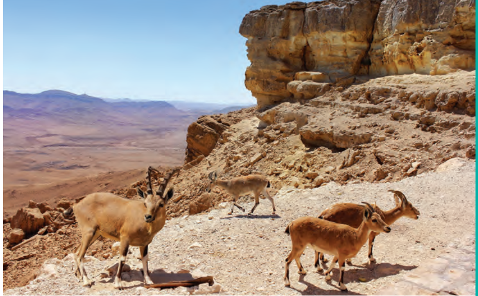
Mountain Goats at Ramon Crater, Mitzpe Ramon

Today, we enter the Old City and walk to the Western Wall , the last remnant of the Second Temple and holiest site of Judaism. Proceed to the Southern Wall Excavations and to the original steps that lead to the Temple Mount. Visit the Davidson Center and explore the Herodian Temple as displayed in this modern Visitors Center with its multimedia presentation. Within the Jewish Quarter, we'll visit the Cardo , once the main Byzantine shopping street. Walk through the extraordinary Hasmonean Tunnel , an underground tunnel excavated to expose the full length of the Western Wall ( tunnel