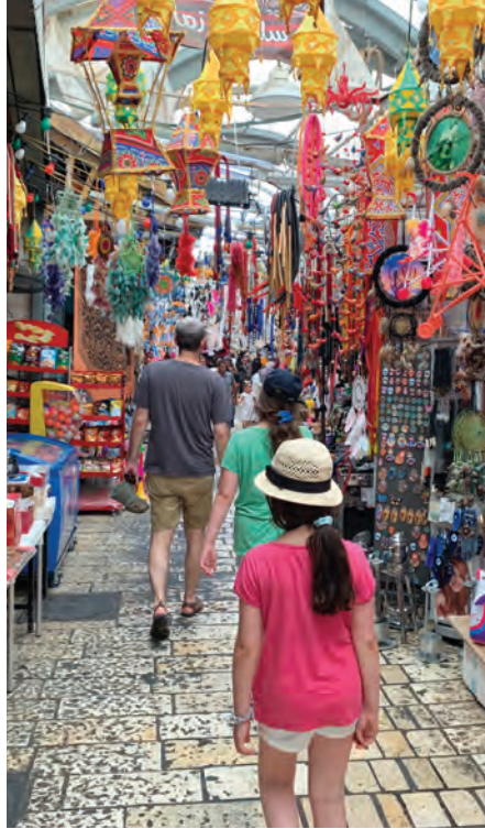
Market at Acre

Drive to Mt. Zion to visit the traditional Tomb of King David and the Room of the Last Supper. Enter the Old City to the restored Jewish Quarter; walk along the Cardo, the colonnaded main street of