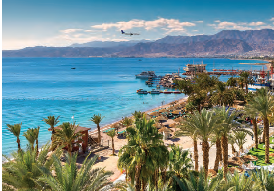
Eilat, Red Sea