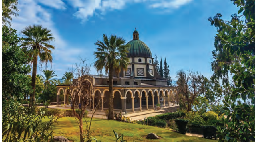
Mt. of Beatitudes, Galilee

This Holyland Pilgrimage Tour provides for a low cost, good quality group-touring program. Isram Israel has teamed up with several other responsible tour organizers to bring to you this weekly scheduled seat-in-coach tour which includes Breakfast and Dinner Daily. Operated by the "Rent-A-Guide" Company, only 2 passengers are required to guarantee this tour so you're sure that when you book, it's a go! An extension to Eilat on the Red Sea is available. This memorable tour unites Christians on a journey to the Land of Israel. Walk in the places He walked, pray in the places He preached and experience the feeling of inner peace and tranquility. There is no better place on earth than the Holyland for Christians to feel the events of Jesus' life. Join us on this life altering experience.