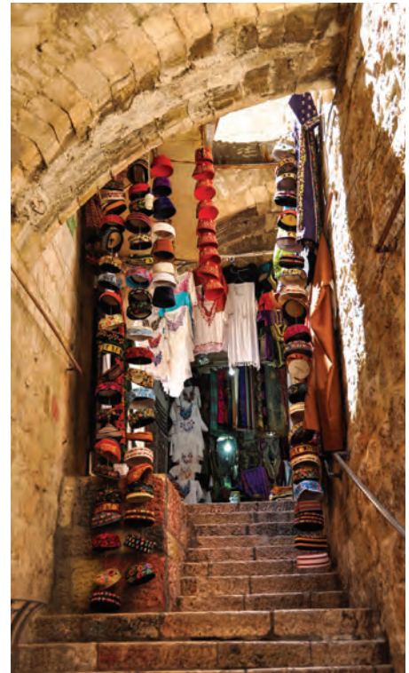
Old City Market

Transfer to the Airport for your international departure flight; special assistance is provided for check-in service.