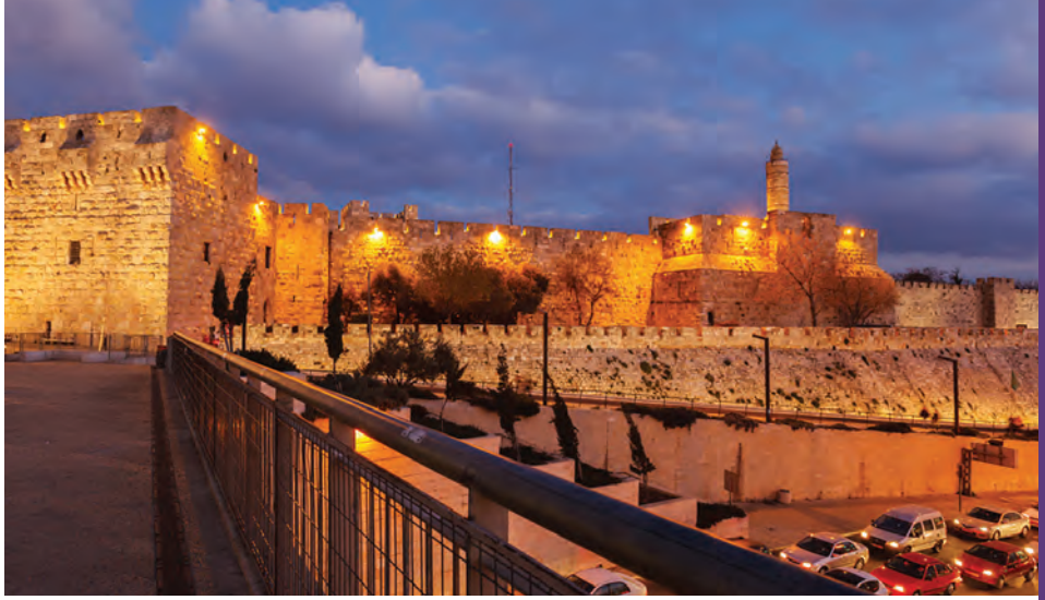
Tower of David, Jerusalem

through the extraordinary Hasmonean Tunnel (tunnel schedule permitting) or tour the Herodian Mansions, a completely excavated residential quarter from 2000 years ago. Follow the Via Dolorosa to the Church of the Holy Sepulchre; stroll through the exotic bazaars with their wondrous aromas. End today with a visit to the fabulous Friends of Zion Heritage Center celebrating the Christian heroes who have contributed to the Jewish people and the State of Israel. The cutting edge technology is amazing. Or, an optional visit to Bethlehem may be arranged. A free night tonight. The shops are open late as it's the start of the Israeli weekend. Enjoy the many eateries along the outdoor Mamilla Mall, Ben Yehuda Street, or the "Tachana". (B)