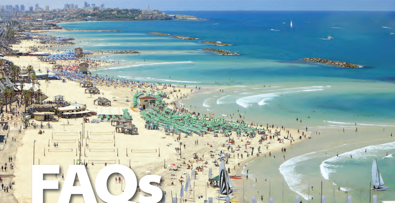
Beaches of Tel-Aviv, Mediterranean Sea