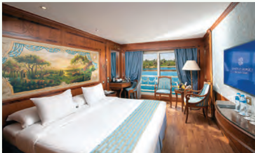
Sonesta St. George - Deluxe Cabin