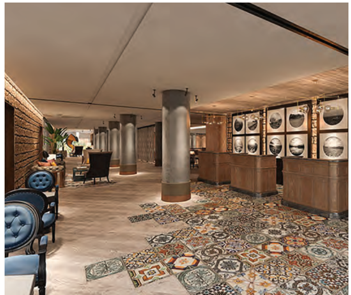
Mitzpe Hayamim, Rosh Pina