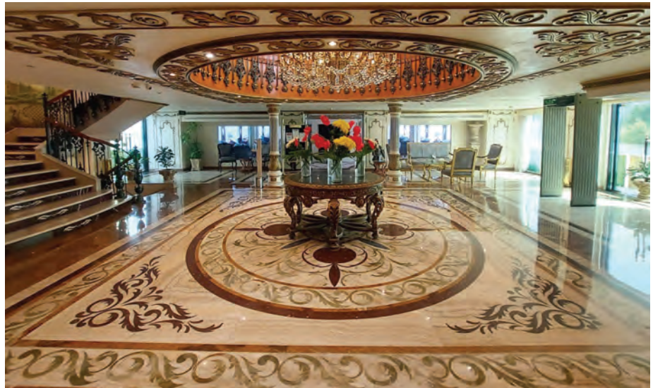
Sonesta St. George Nile Cruise

Transfer to Cairo Airport for your departure flight. (B) The cruise line reserves the right to alter the sailing schedule.