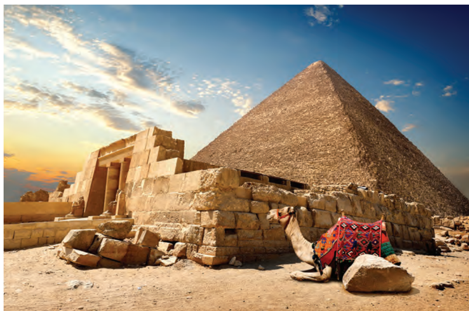
The Pyramids, Egypt

Begin the day with a visit to Giza to see the Three Great Pyramids, the oldest surviving structures built by man; enter one of the Pyramids. Stand in awe at the magnificent Sphinx carved out of a single piece of stone, guarding the Giza plateau. Try a camel ride before continuing for lunch at a local