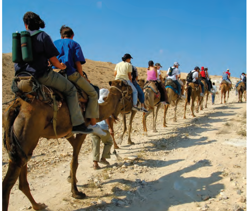
Camel Trekking in the desert

Highlights: Bar/Bat Mitzvah Ceremony at Masada • Sound & Light Show in Jerusalem • Rabbinical Tunnel • Davidson Center • City of David • Archaeological Dig • Camel Ride in the Desert • Bedouin "Hafla" Dinner • Chocolate Making Workshop • Oil Pressing & Donkey Rides • Rafting on the Jordan River • Zip Lining on the Omega • Visit an Army Base • Jeep Riding in the Golan Heights • Tree Planting at Neot Kedumim • Volunteer work at Leket Israel • Many more Special Events and lots of surprises!