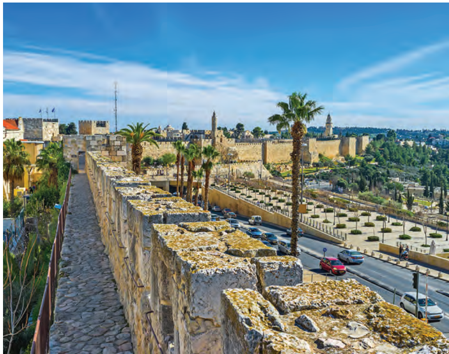
View from the Ramparts, Jerusalem