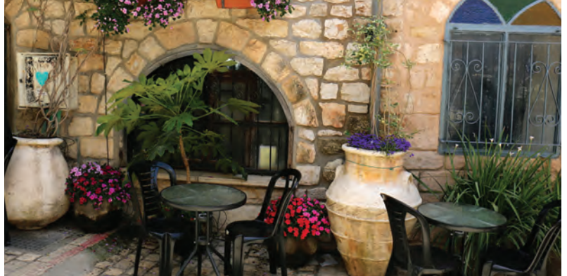
Colorful Neighborhood in Safed