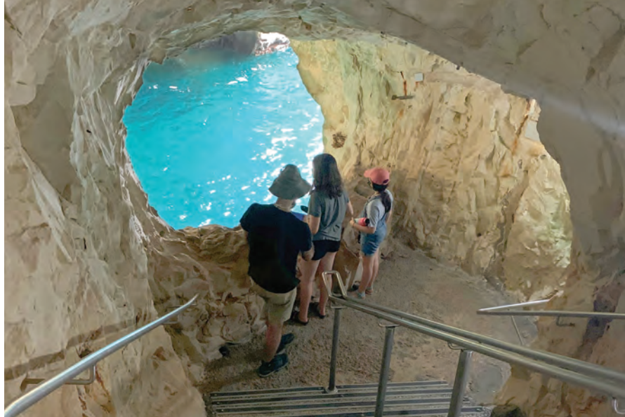
Grottoes at Rosh Hanikra