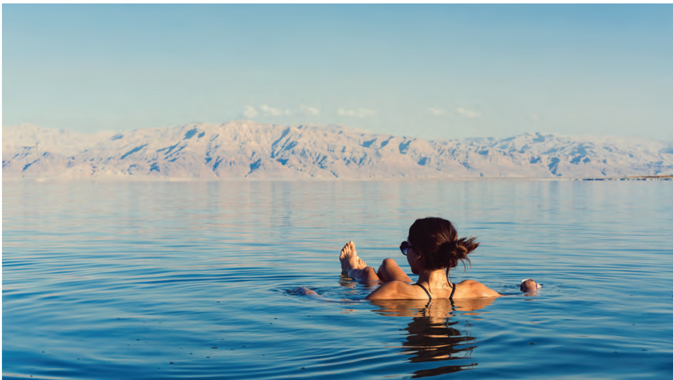
Floating on the Waters of the Dead Sea

MIX & MATCH THE ABOVE HOTELS. FOR TOURING BY PRIVATE CAR, SEE PAGE 30.