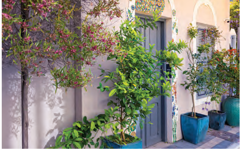
Neve Tzedek, Tel Aviv