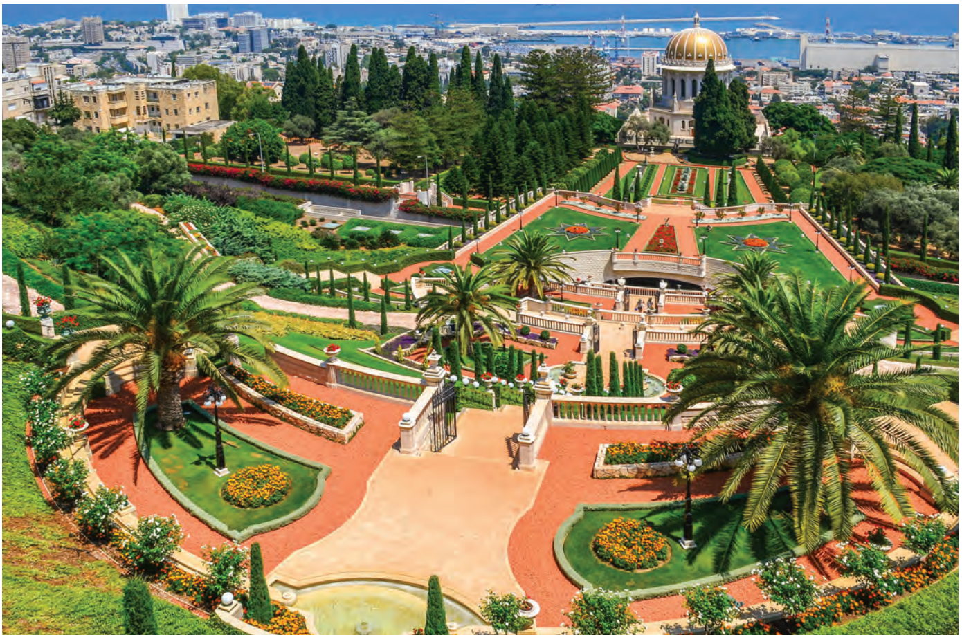
Bahai Temple and Gardens, Haifa

Depart Haifa en route to Safed, one of Judaism's holiest cities, where the Kabbalah was developed in the 16th-century; visit the ancient synagogues and the charming