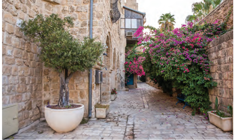
Cobblestone Street of Jaffa