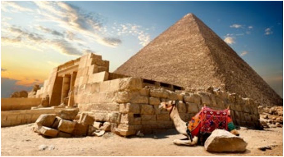
The Pyramids, Egypt

Transfer to the airport for your departure flight. (B)