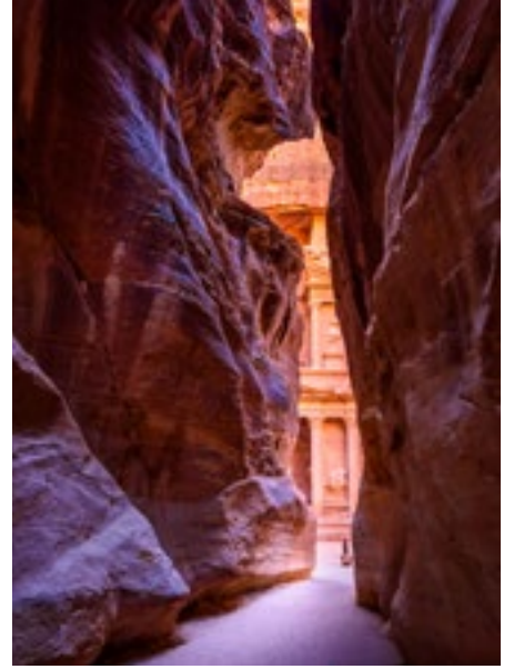
The Siq, Petra, Jordan

A most unforgettable day in Petra ! Your local guide will take you on a tour into the "rose-red" city (by horseback and foot), from the main gate to the beginning of the "Siq". At the end of the passage you'll see Petra's most beautiful monument—the Treasury—carved out of the solid rock from the side of the mountain. Beyond the