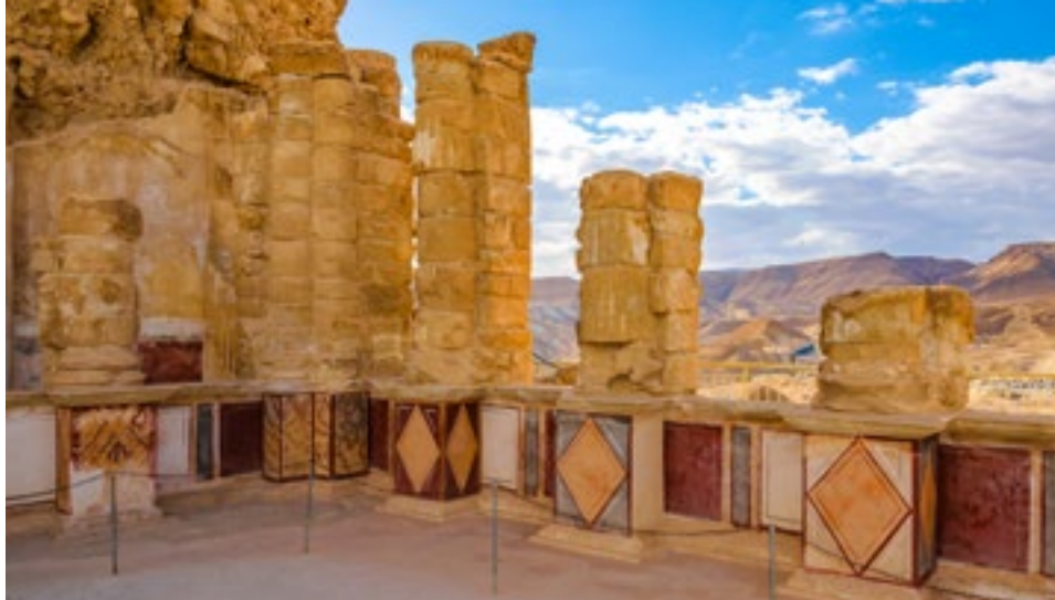
Herod's Palace, Masada

Descend through the Judean desert to the Dead Sea, lowest point on Planet Earth. Ascend Masada by cable car and see this last