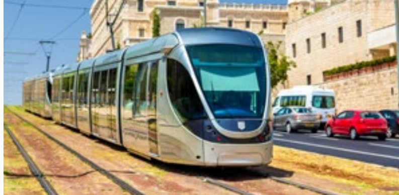
Light Train, Jerusalem