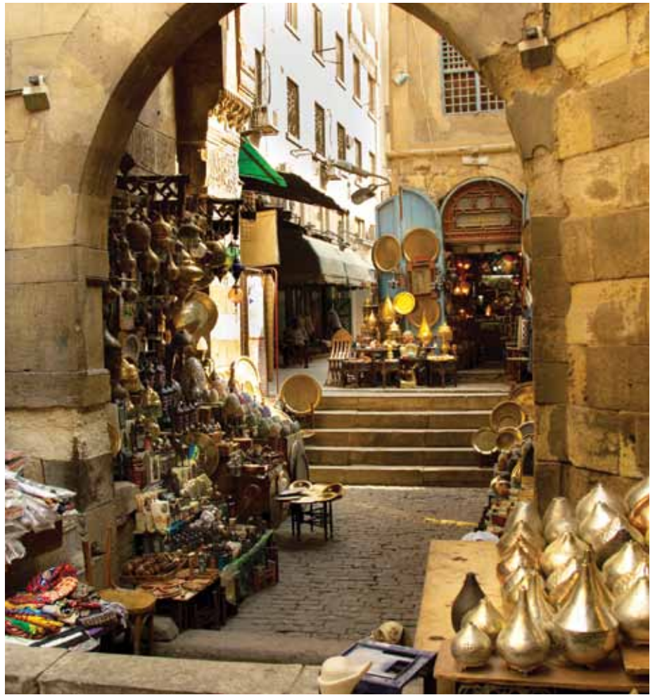
Local Bazaar, Cairo