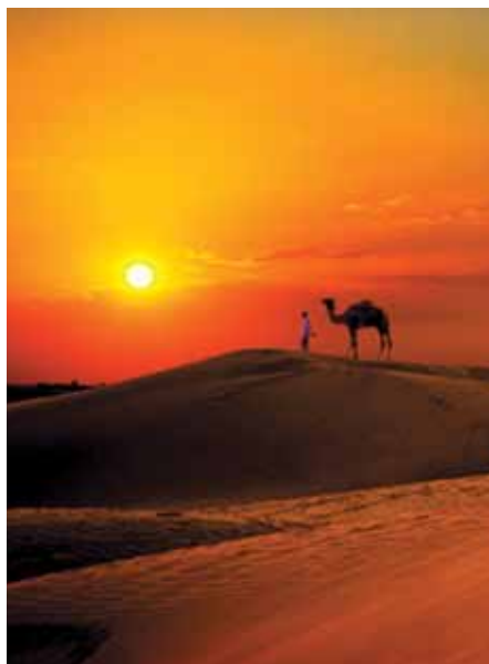
Egypt Sunset in the Desert

Morning set sail to Aswan. Visit the Aswan High Dam and the granite quarries where the stone for the ancient monuments and modern dam of Aswan were cut. View the gigantic, unfinished Obelisk of Queen Hatshepsut. Continue by motorboat to the beautiful island of Philae to see the exquisite, gleaming white Temple of Isis. After lunch, sail on a traditional Egyptian "felucca" (sailboat) which glides along the Nile, passing by Lord Kitchener's Island and the dramatic white marble Aga Khan Mausoleum. Nubian Show this evening after dinner on board. Overnight in Aswan. (B.L.D)