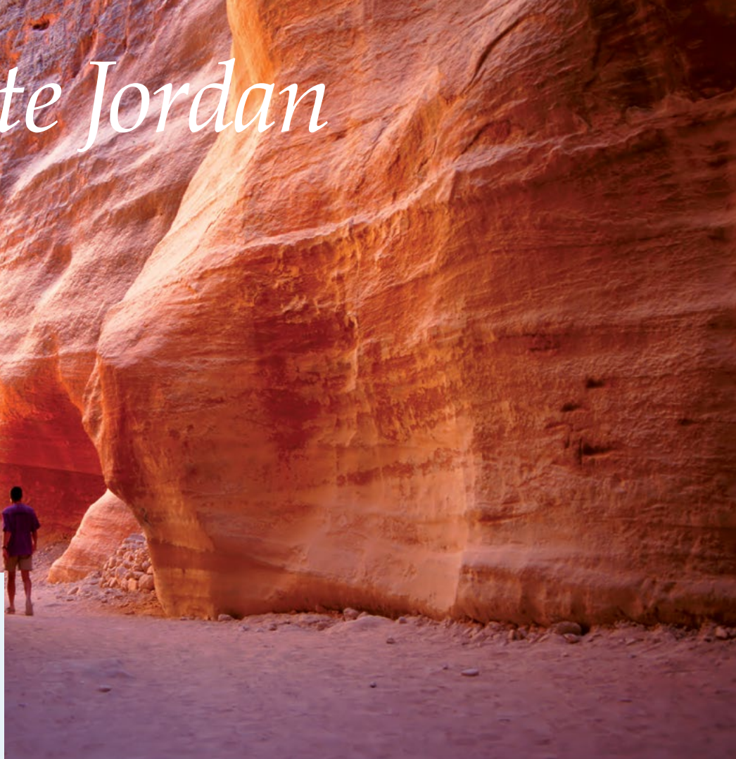
The Siq – Petra

From the modern capital city of Amman, to the archaeological wonders of Petra, to the breathtaking red rock desert landscape of Wadi Rum, and the wondrous Dead Sea, our professional guide will take you on an illuminating journey through Jordan’s most incredible sites. Enjoy stunning accommodations including a unique glamping experience under a starlit sky in Wadi Rum. This program combines a timeless cultural environment with luxurious amenities, including top-of-the line vehicles, providing the “Ultimate Jordan” experience.