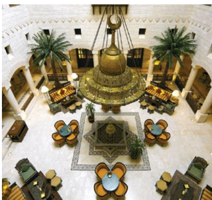
Movenpick Petra Resort

* Tour is based on 2 passengers traveling together privately. For singles traveling alone, supplement applies to the single room rate, please inquire.