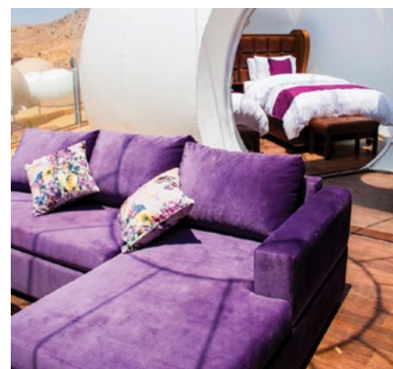
Bubble Luxotel Wadi Rum