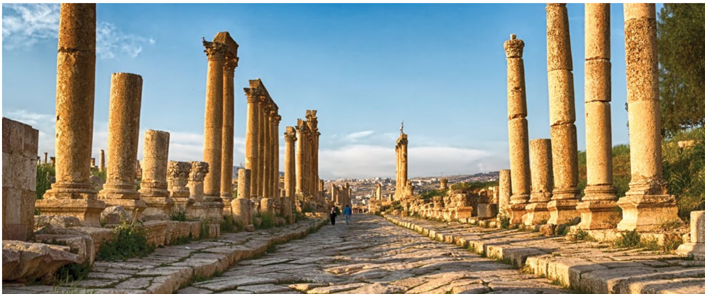
Ancient Jerash – Ruins of the Greco-Roman City

city steeped in history, known by many names during its long and eminent past. Visit the magnificent castle before continuing on to Petra, built by the Nabateans over 2000 years ago. Tonight enjoy dinner at the “Petra Kitchen” including Jordanian cooking lessons. Overnight in Petra. (B.L.D)