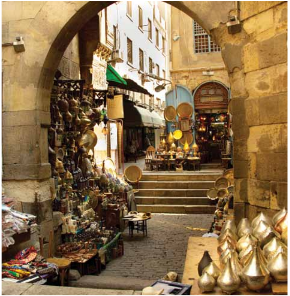
Local Bazaar, Cairo