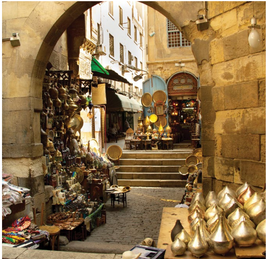
Local Bazaar, Cairo

Flanked by four giant stone statues of Ramses II, the temple was reclaimed from the dam and reconstructed in its present and unforgettable location. Return flight to Cairo where you will be met and transferred to your hotel. Overnight in Cairo. (B)