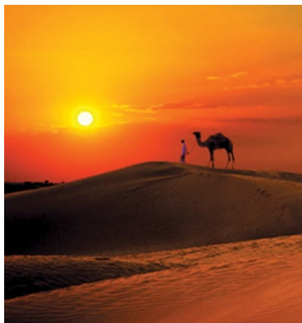
Egypt Sunset in the Desert

After disembarkation, board a short flight together with your guide from Aswan to the mighty Sun Temple of Abu Simbel.