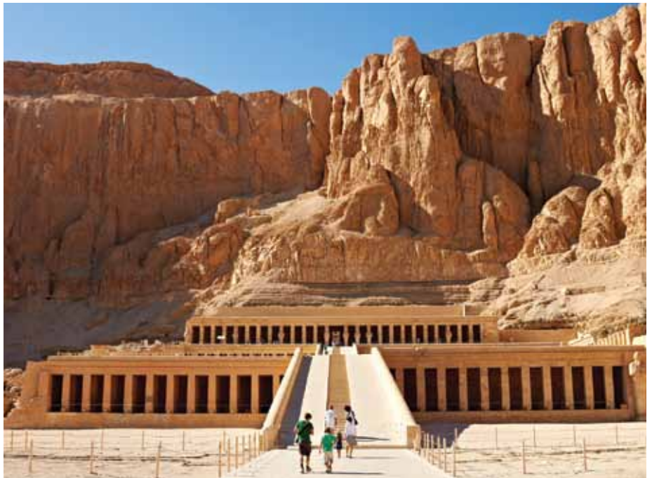
Queen Hatshepsut Temple

Morning set sail to Aswan. Visit the Aswan High Dam and the granite quarries where the stone for the ancient monuments and modern dam of Aswan were cut. View the gigantic, unfinished Obelisk of Queen Hatshepsut. Continue by motorboat to the beautiful island of Philae to see the