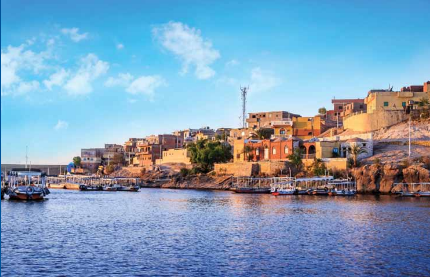
Village on the Banks of the Nile, Aswan

flight to Cairo where you will be met and transferred to your hotel. This evening, enjoy a Sound & Light Show at the Pyramids. Overnight in Cairo. (B)