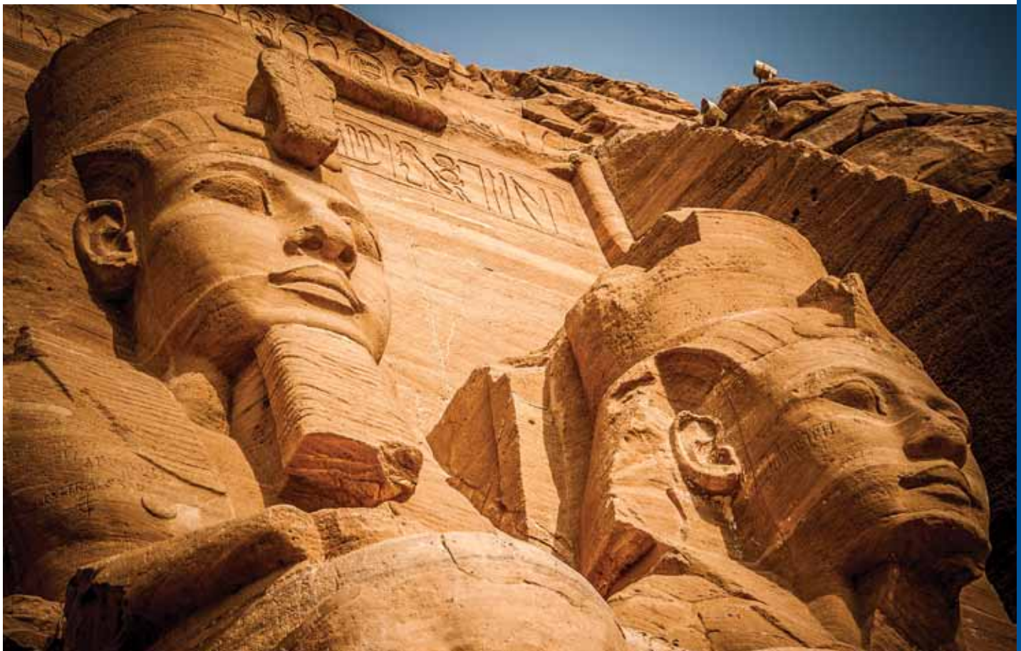
Ramses II Statue close up, Abu Simbel

After disembarkation, board a short flight with your IsramBeyond escort/guide from Aswan to the mighty Sun Temple of Abu Simbel, flanked by four giant stone statues of Ramses II. The temple was reclaimed from the dam and reconstructed in its present and unforgettable location. Return