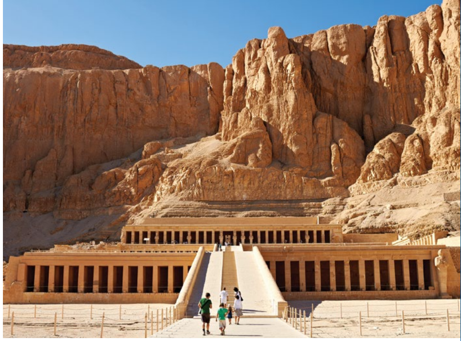
Queen Hatshepsut Temple

Morning set sail to Aswan. Visit the Aswan High Dam and the granite quarries where