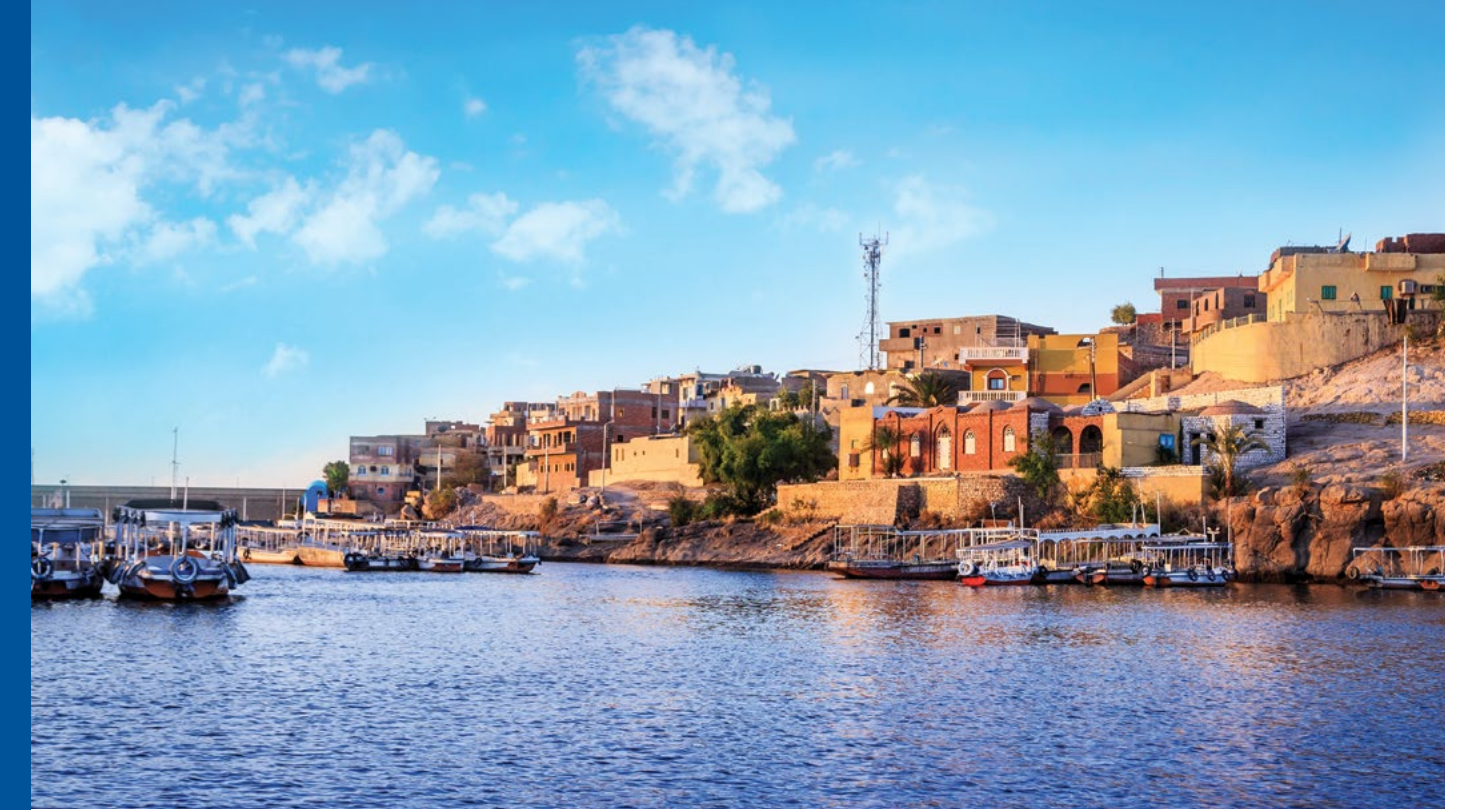
Village on the Banks of the Nile, Aswan