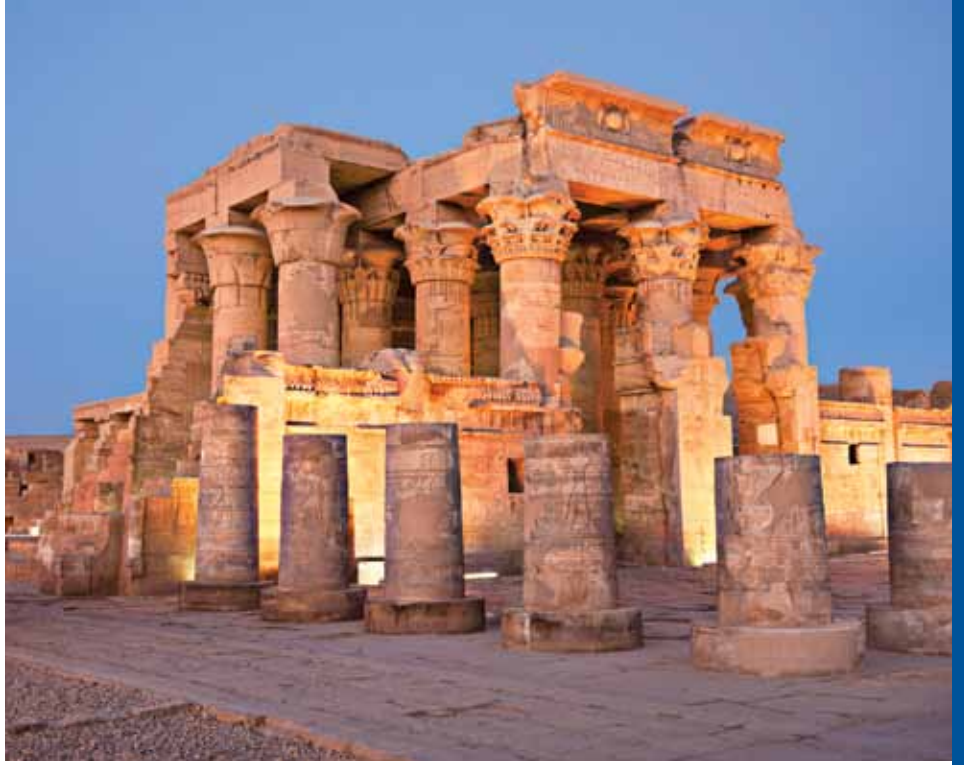
Temple of Kom Ombo

Please Note: The cruise line reserves the right to alter the sailing schedule.