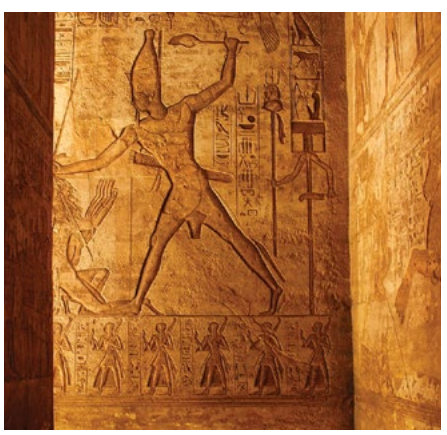
Within the Sun Temple – Abu Simbel

Please Note: The cruise sailing schedule alternates with some sailings beginning in Aswan and ending in Luxor. In such cases, Abu Simbel excursion will be conducted on the first day of the cruise sailing. Cruise line reserves the right to alter the sailing schedules.