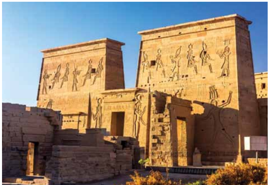
Philae Temple, Aswan

Drive to the imposing Valley of the Kings containing the secretive tombs of New Kingdom Pharaohs; enter the astonishing Tomb of Tutankhamen. Followed with a visit to the Temple of Medinet Habu, Dier El Madina. On the way back, stop at the Colossi of Memnon. The boat sails to Esna for overnight. (B.L.D)