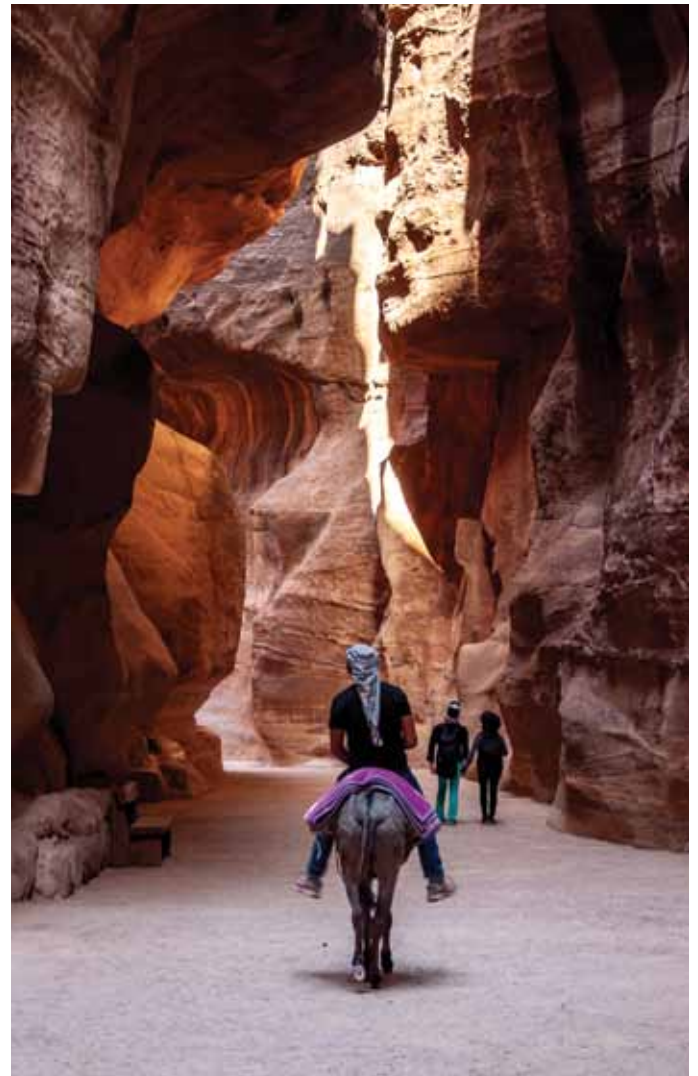
Horseback ride in Petra

Your private guide will take you on a tour into the "rose red city" of Petra. Travel on horseback or on foot beginning at the awesome "Siq", a winding canyon road. Marvel at one of Petra's most impressive monuments, The Treasury (Khazneh) , carved out of a single piece of rock. Beyond the Treasury, you'll discover soaring temples, elaborate royal tombs, a theatre, burial chambers and water channels. After lunch in Petra, drive back to the Arava Crossing for re-entry to Israel. ( Transfer to your ongoing destination is not included ). (B.L)