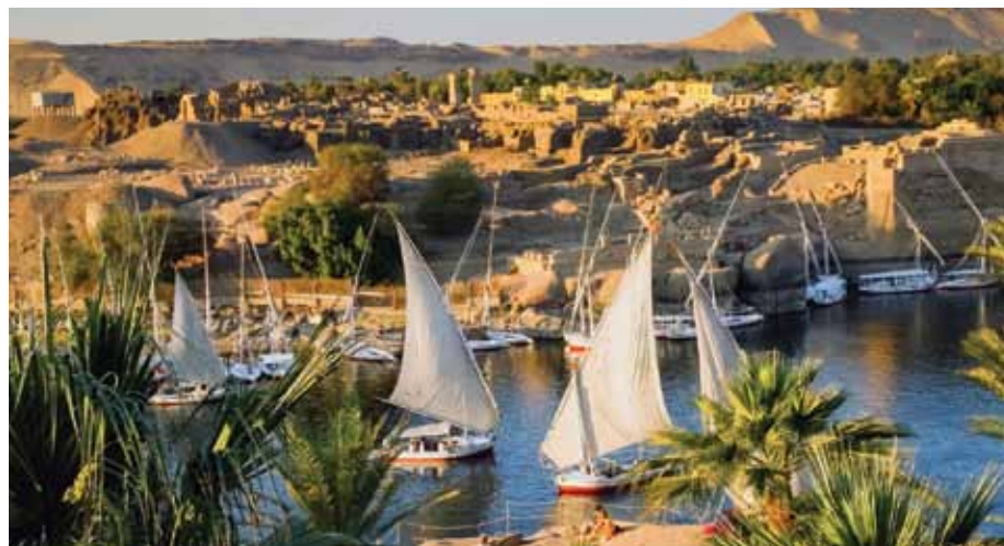
"Feluccas" Sailing on the Nile

The cruise line reserves the right to alter the sailing schedule.