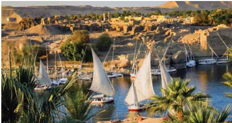
"Feluccas" Sailing on the Nile

The cruise line reserves the right to alter the sailing schedule.