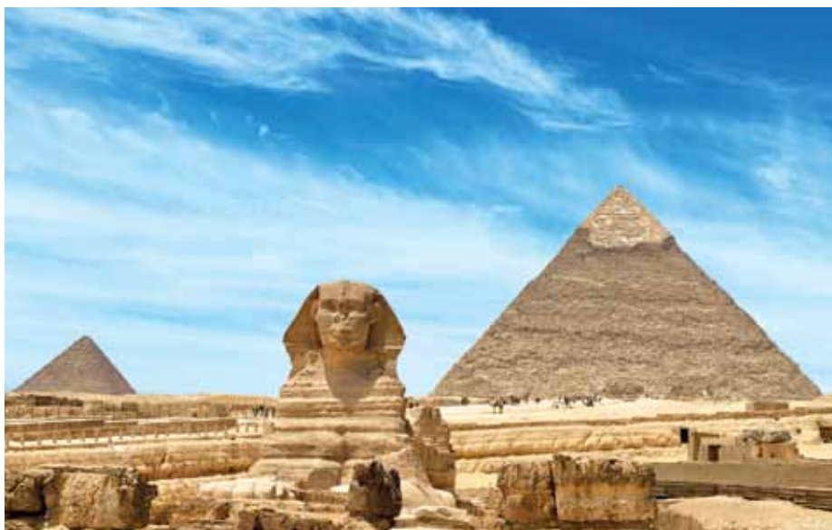
Pyramids & Sphinx in Giza, Egypt

Transfer to the airport for your departure flight. (B)