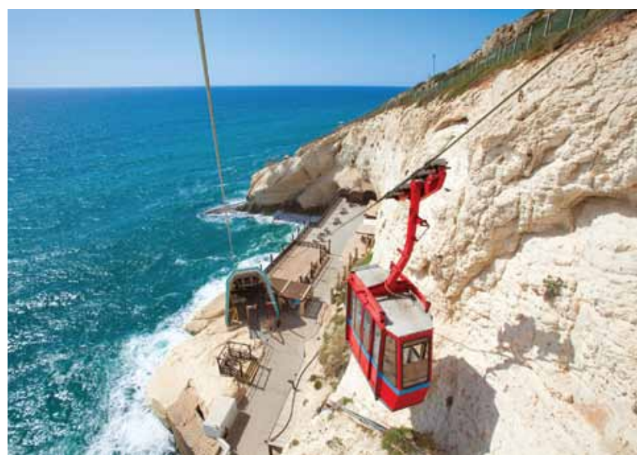
Cable car to Underwater Grottos at Rosh Hanikra

about the 20th century battles. Continue to Katzrin, capital of the Golan and to the Monument of the 7th Brigade. In the magnificent strip of the Golan known for producing the finest wines in the world, enjoy wine tasting and a tour of the wine making process. Continue for a visit to a former Syrian army bunker at Kibbutz Kfar Charuv, settled by Americans and Israelis together. Enjoy a late lunch in the communal dining room. Then drive south to Jerusalem, stopping first for a blessing and a toast to our arrival in the eternal city. Overnight in Israel's capital. (B.L)