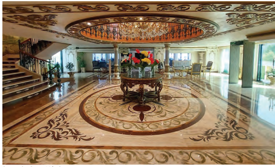
Sonesta St. George Nile Cruise

Transfer to Cairo Airport for your departure flight. (B) The cruise line reserves the right to alter the sailing schedule.