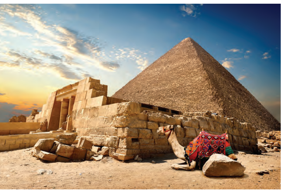
The Pyramids, Egypt

Transfer to the airport for your departure flight. (B)