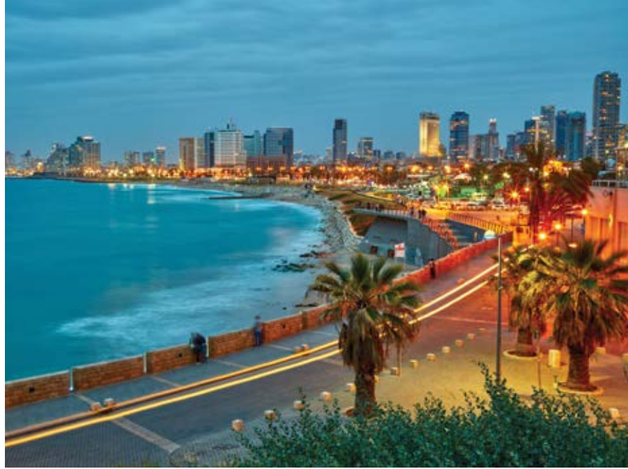
Tel-Aviv by Night