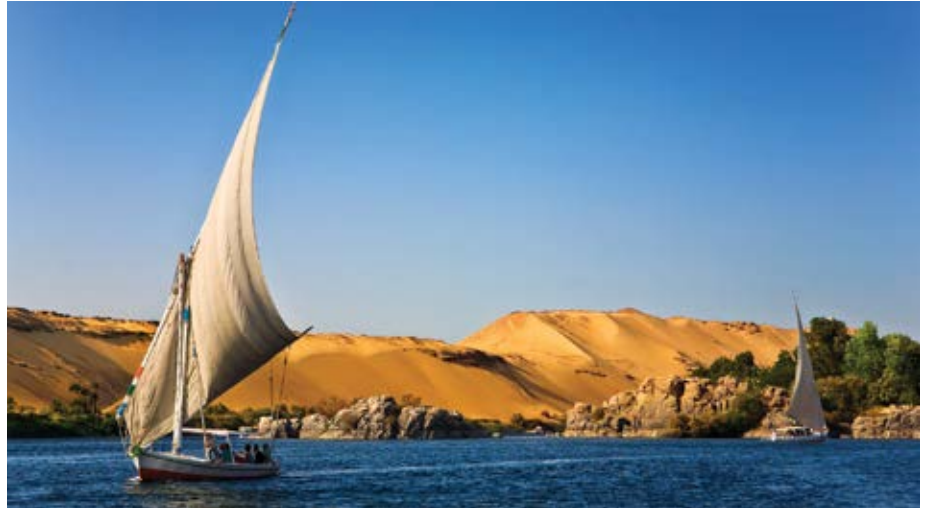
"Feluccas" Sailing on the Nile

Transfer to Cairo Airport for your departure flight. (B) The cruise line reserves the right to alter the sailing schedule.