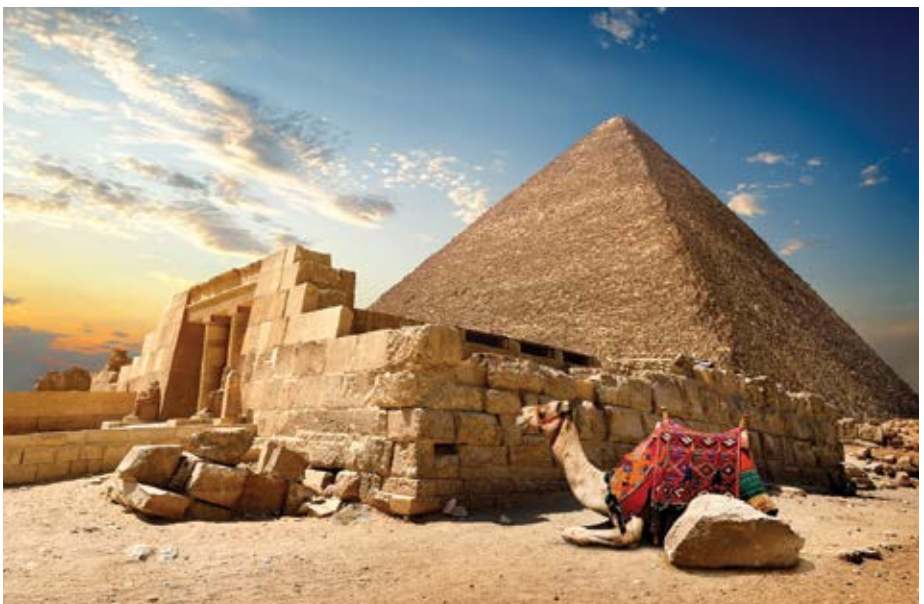
The Pyramids, Egypt

Transfer to the airport for your departure flight. (B)