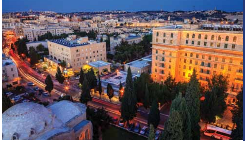
New City of Jerusalem

Depart Tel Aviv. Drive to the extraordinary Israeli Museum at the Yitzhak Rabin Center chronicling the life of the late Prime Minister and the development of the State of Israel. Continue to ancient Caesarea; explore the Roman and Crusader ruins including the impressive 2,000-year-old theater (still in use!) and aqueduct. Then, visit Caesarea Harbor: a fascinating, multi-media presentation brings ancient history to life! Arrive in Nazareth, the sacred town where Jesus spent part of his youth; visit the Church and view Mary's Well. On to the sparkling port city of Haifa; check into your hotel atop Mt. Carmel. Evening: Enjoy Dinner and a special cultural presentation (subject to minimum 10 tour participants). (B.D)