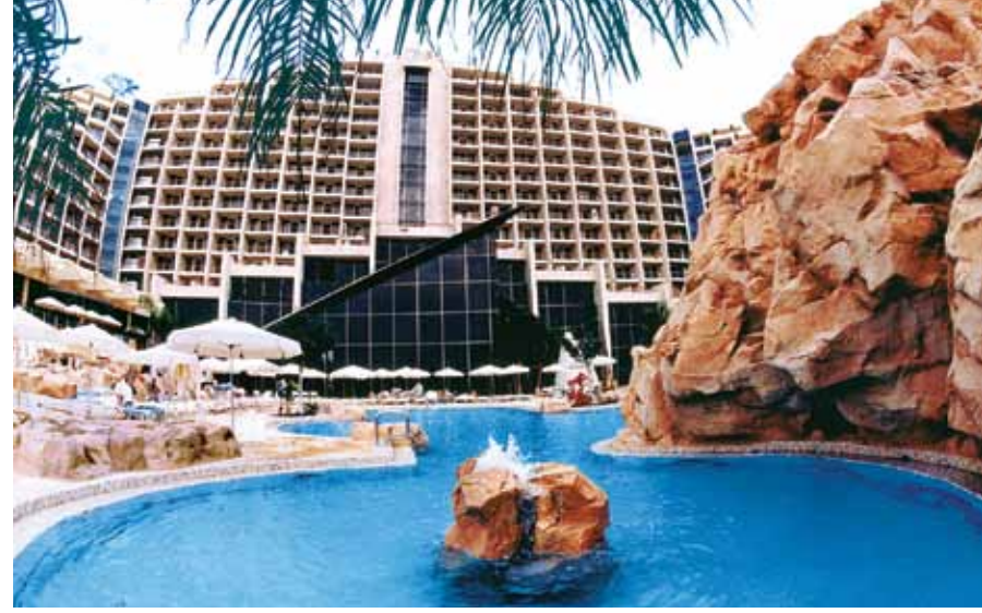
Dan Eilat Hotel