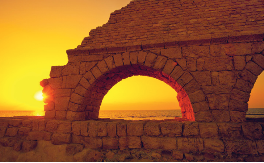
Roman Aqueduct, Caesarea

Depart Tel Aviv. Drive to the extraordinary Israeli Museum at the Yitzhak Rabin Center chronicling the life of the late Prime Minister and the development of the State of Israel. Continue to ancient Caesarea; explore the Roman and Crusader ruins including the impressive 2,000-year-old theater (still in use!) and aqueduct. Then, visit Caesarea Harbor: a fascinating, multi-media presentation brings ancient history to life! Arrive in Nazareth, the sacred town where Jesus spent part of his youth; visit the Church and view Mary's Well. On to the sparkling port city of Haifa; check into your hotel atop Mt. Carmel. Evening: Enjoy Dinner and a special cultural presentation (subject to minimum 10 tour participants). (B.D)