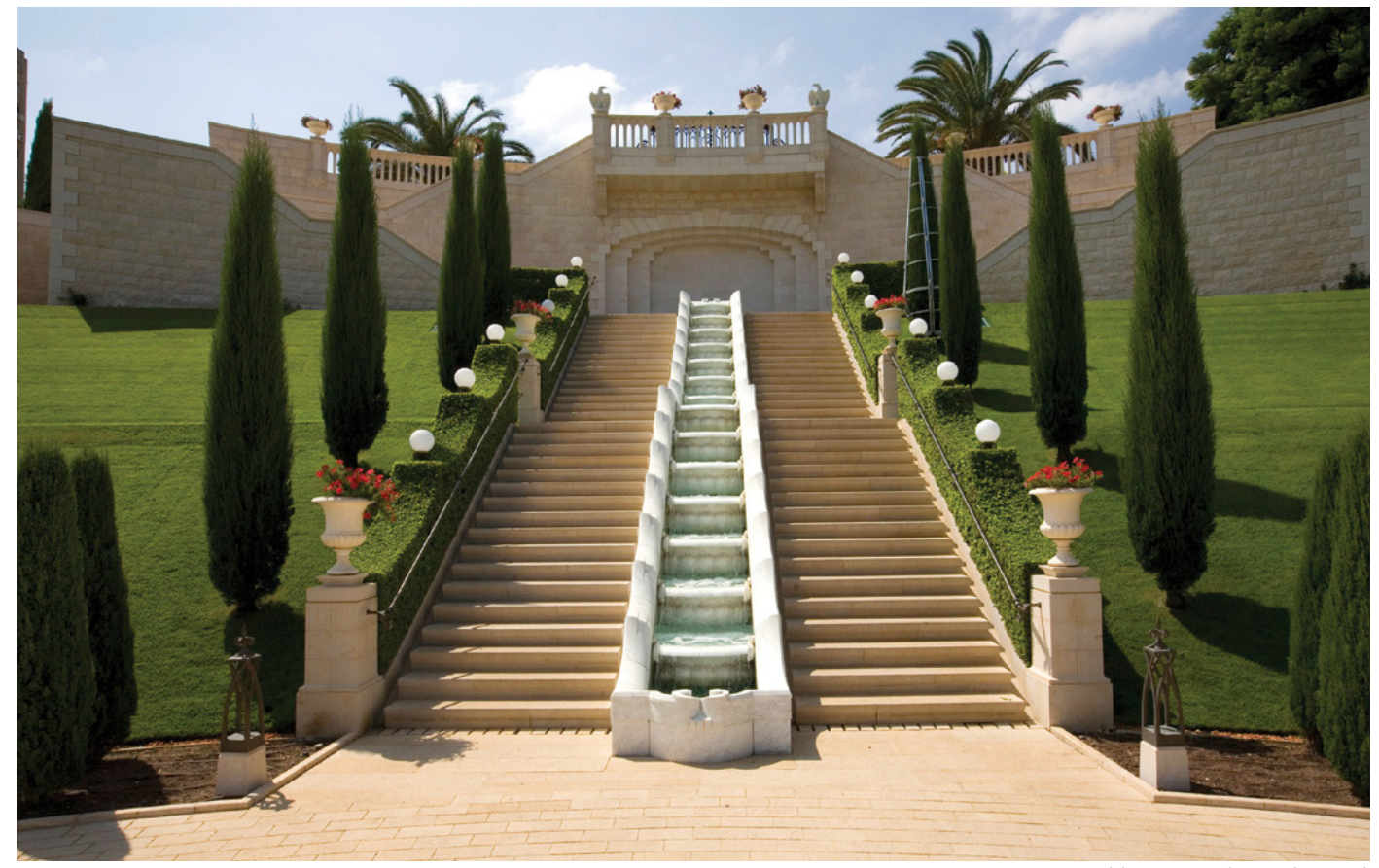
Staircase and fountain at Baha'i Gardens, Haifa

We'll depart Haifa driving first to Capernaum to see the fantastic ruins of the ancient synagogue dating back to the 5th-century. Ascend the strategic Golan Heights and learn about the 20th century battles that protected Israel's future. On to Katzrin, capital of the Golan and to the Monument of the 7th Brigade. It is here, in the magnificent strip of the Golan that has become known for producing the finest wines in the world, that we will enjoy a tour of the wine making process as well as sample some of the Golan's tastiest wines. Continue for a visit to a former Syrian army bunker at Kibbutz Kfar Charuv, settled by Americans and Israelis together; view of the fertile valleys below as you tour the kibbutz and enjoy lunch in the communal dining