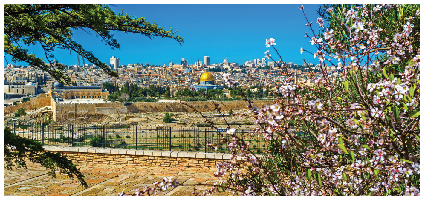
View of Jerusalem

Transfer to the Airport for your international departure flight. Enjoy our Express Check-in Service and complimentary entrance to the exclusive Dan VIP Lounge.