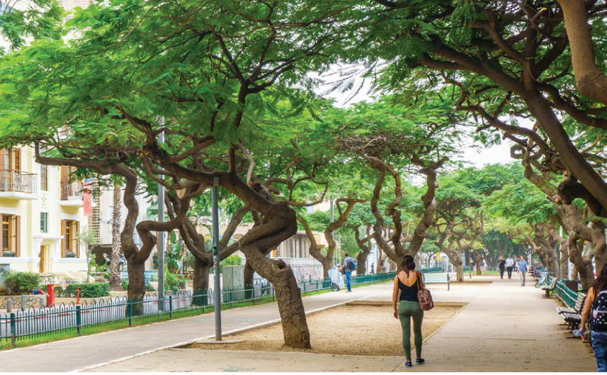
Rothschild Boulevard, Tel Aviv