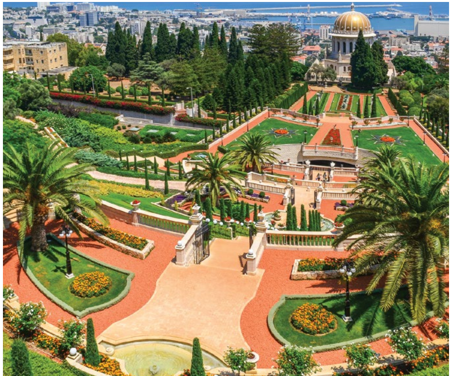
Hanging Gardens at the Baha'i Shrine, Haifa

Depart Haifa en route to Safed, one of Judaism's holiest cities; visit the ancient synagogues and the charming Artists' Quarter. Then onto Capernaum, overlooking the Sea of Galilee, to see the fantastic ruins of the ancient synagogue dating back to the 5th-century. Ascend the strategic Golan Heights and learn about