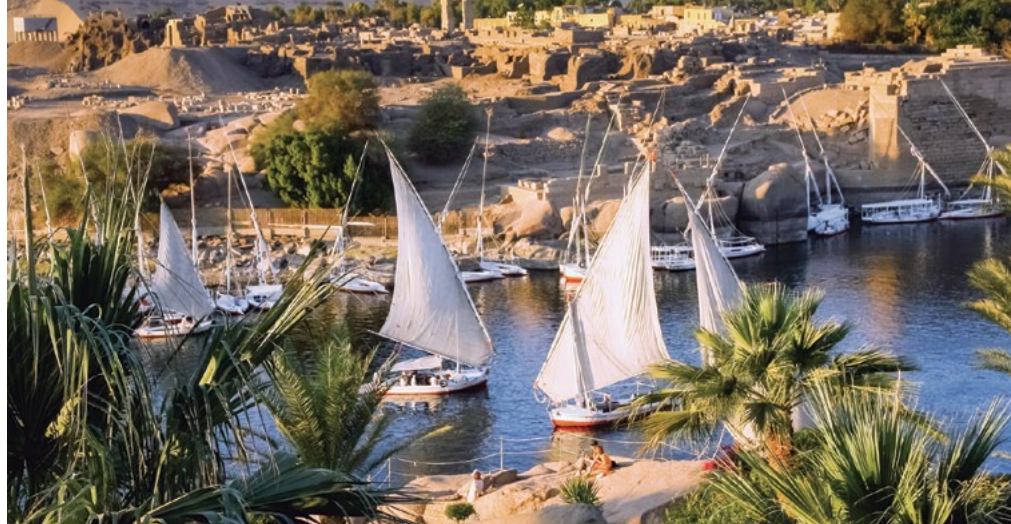
"Feluccas" in Aswan

Today, discover a most unforgettable day in the "hidden" city of Petra . Travel on horseback or on foot into the "rose-red" city to the awesome " Siq ", a winding canyon road. Continue by foot to visit one of Petra's most impressive monuments, the Treasury , made famous in the movie "Indiana Jones", carved out of solid rock from the side of the mountain. Beyond the Treasury , you'll discover soaring temples, elaborate royal tombs, a theatre, burial chambers and water channels. After lunch, depart Petra and drive north to Amman , the modern and ancient capital of Jordan. Check into your hotel for overnight. (B.L)