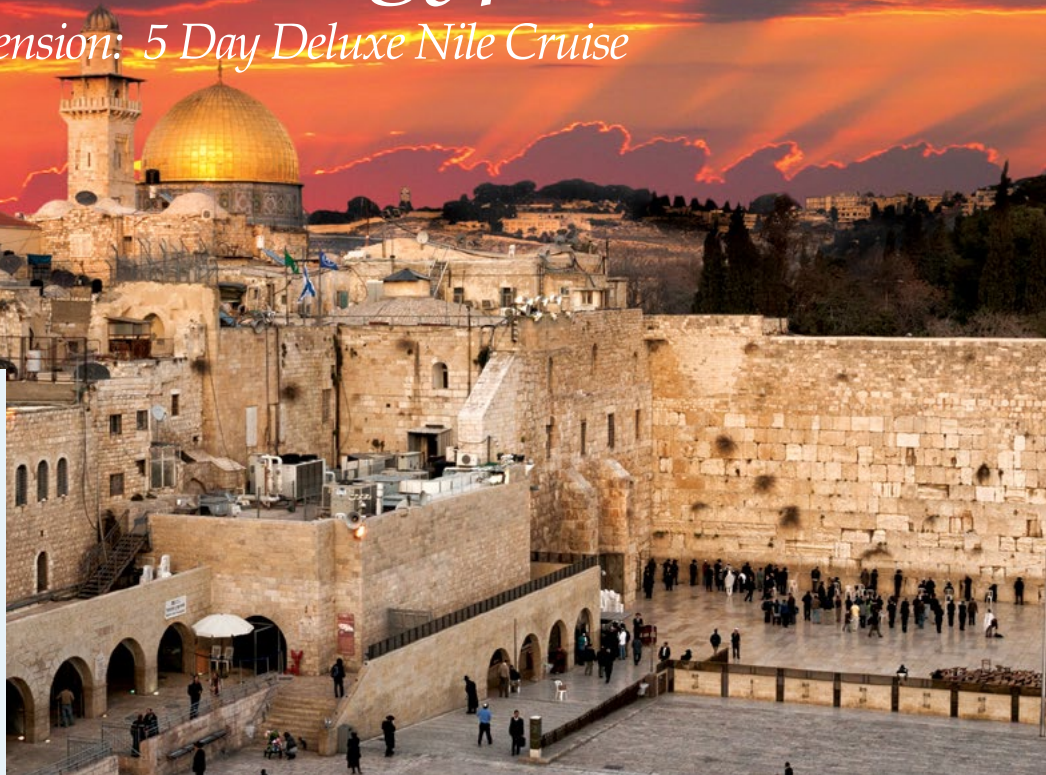
Western Wall, Jerusalem