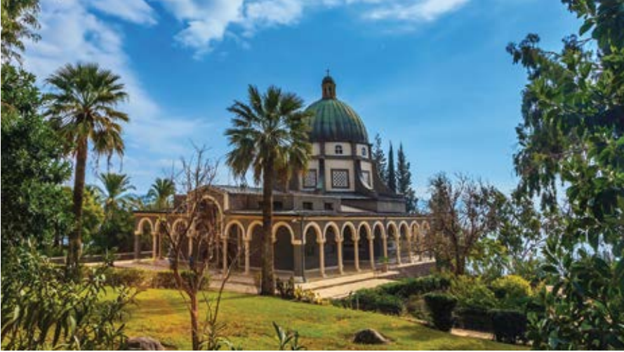
Mt. of Beatitudes, Galilee

This Holyland Pilgrimage Tour provides for a low cost, good quality grouptouring program. Isram Israel has teamed up with several other responsible tour organizers to bring to you this weekly scheduled seat-in-coach tour which includes Breakfast and Dinner Daily. Operated by the "Rent-A-Guide" Company, only 2 passengers are required to guarantee this tour so you're sure that when you book, it's a go! An extension to Eilat on the Red Sea is available. This memorable tour unites Christians on a journey to the Land of Israel. Walk in the places He walked, pray in the places He preached and experience the feeling of inner peace and tranquility. There is no better place on earth than the Holyland for Christians to feel the events of Jesus' life. Join us on this life altering experience.