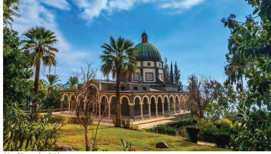
Mt. of Beatitudes, Galilee

This Holyland Pilgrimage Tour provides for a low cost, good quality grouptouring program. Isram Israel has teamed up with several other responsible tour organizers to bring to you this weekly scheduled seat-in-coach tour which includes Breakfast and Dinner Daily. Operated by the "Rent-A-Guide" Company, only 2 passengers are required to guarantee this tour so you're sure that when you book, it's a go! An extension to Eilat on the Red Sea is available. This memorable tour unites Christians on a journey to the Land of Israel. Walk in the places He walked, pray in the places He preached and experience the feeling of inner peace and tranquility. There is no better place on earth than the Holyland for Christians to feel the events of Jesus' life. Join us on this life altering experience.